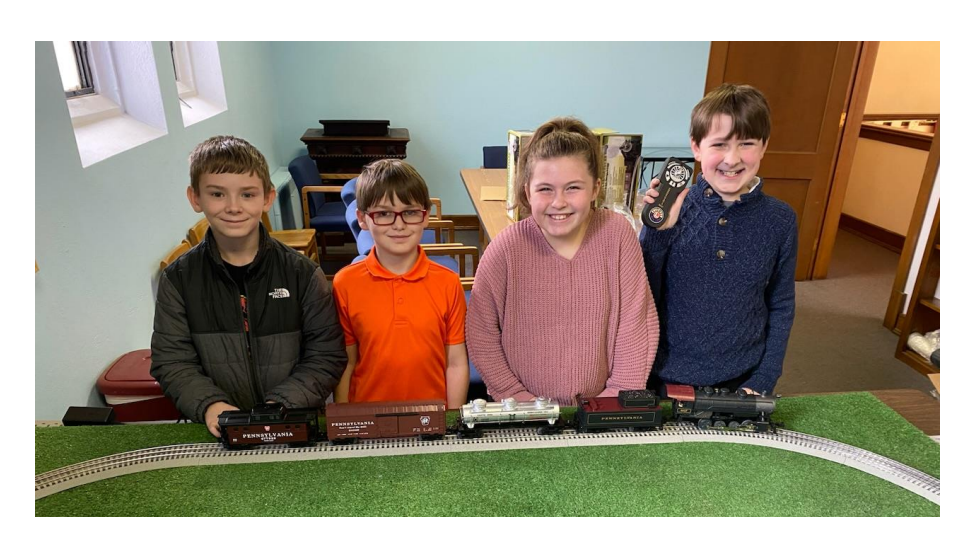
Zion's Bring a Friend to Breakfast, a huge success on Palm Sunday.

Zion's Youth Sunday School shares fellowship in their new Youth Space by building an O Scale Lionel train layout. Donations of train supplies appreciated. It is the hope that the kids can continue growing the layout while enjoying weekly fellowship together.